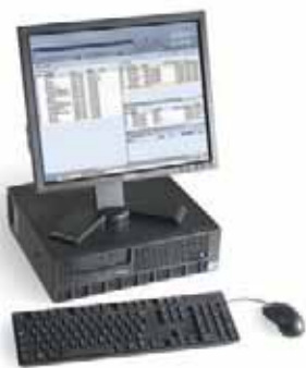
Xerox® FreeFlow® Print Server

Each server is designed to meet a specific set of workflow and application requirements. Your Xerox representative will help you choose the one that best suits your needs.