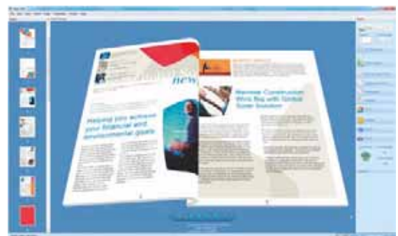
Xerox® Integrated Fiery® Colour Server