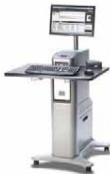
Xerox® EX Print Server, Powered by Fiery®*